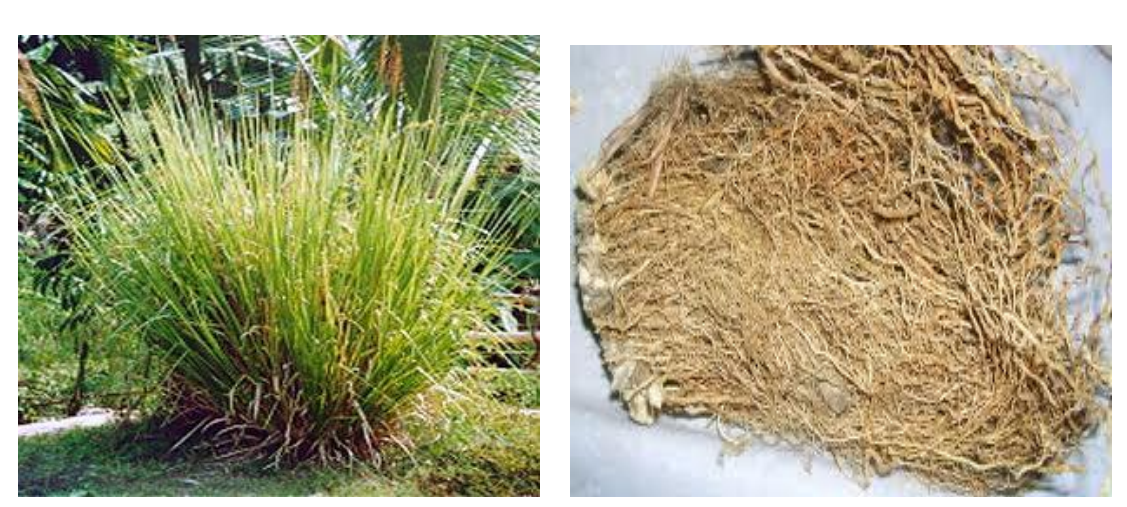
Fig.1: Whole Plant of Vetiveria Zizanioides